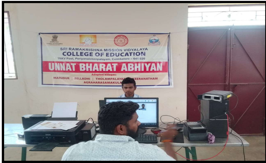
Aadhaar Camp at Marudur Village