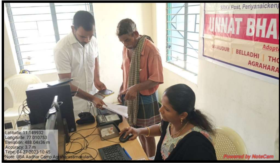
Aadhaar Camp at Village in Agrahasamakulam on 27.04.2023