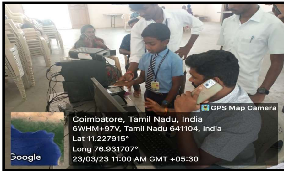
Aadhaar Camp at Marudur Village 23.03.2023